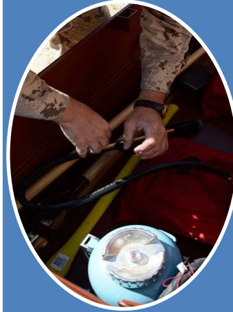
Medical & Firefighting personnel