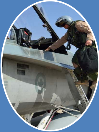
Air Task Force