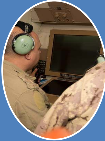
Liaison & Command and control personnel